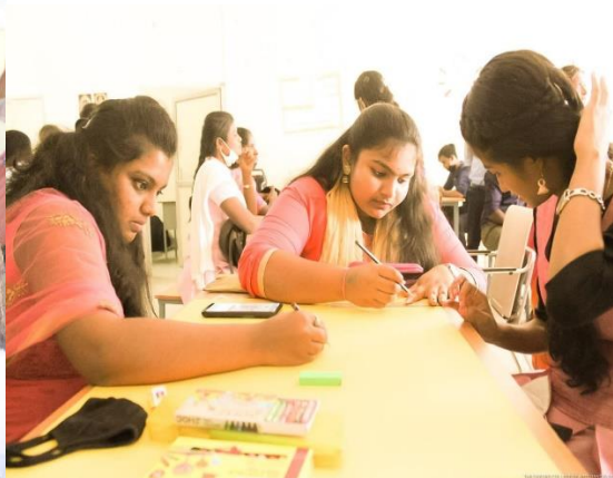
After the main event. We ended the day with all the girls gathered in-groups to participate in poster making which made the day more fun and productive.